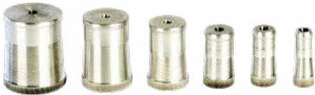
FIG. 3 Calderprep™ Plus Mandrel Inserts 20-25-32-40-50-63mm