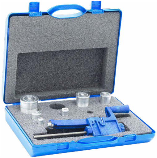
FIG. 1 Calderprep™ Plus Tool Kit