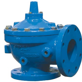
FIG. 1 Alternative model A106-PG Angle

Refer to the Singer Control Valve Sizing Calculator on our website for assistance.