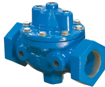
FIG. 2 Alternative model 106-PG THREADED