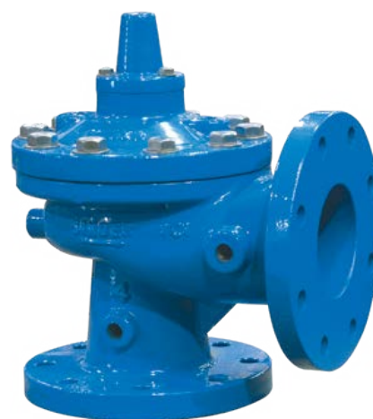
FIG. 1 Alternative models A206-PG Angle

Refer to the Singer Control Valve Sizing Calculator on our website for assistance.